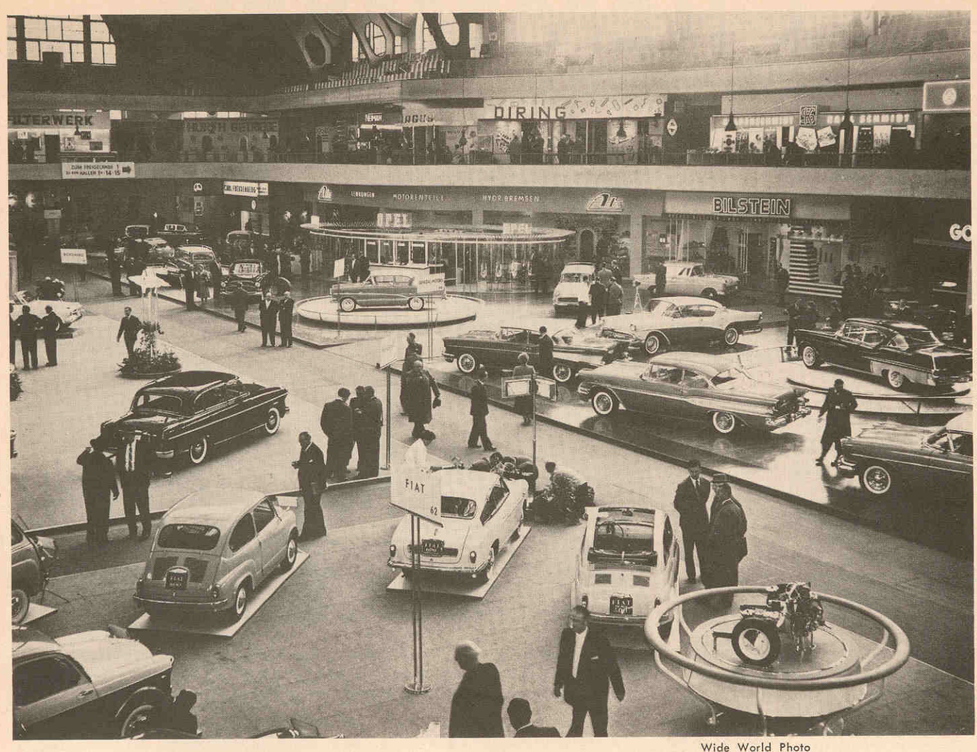
Three years ago the West Germans staged this spectacular coming-out show for the Auto Industry. Now, three years later, German cars and Germanproduced foreign cars are rapidly engulfing the void left by declining American markets abroad.

seemed RIDICULOUS to many people. I will never forget the time-only eight years ago-when I was speaking to a small church group in San Diego, California. I was telling them that we were right then in the process of building our FRANKENSTEIN MONSTER by rebuilding Germany so quickly to real POWER.